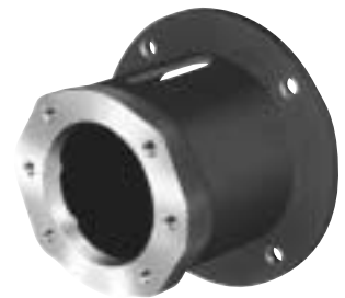
TABLE 7 - NEMA Frames 56C, 143TC/145TC, 182UC/184UC